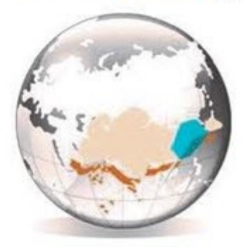
Parma, Italy 09 – 10 October Hosted By: